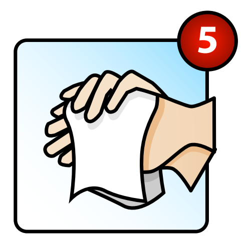
Dry your hands thoroughly with a disposable paper towel.

Apply regular liquid soap. Antibacterial soap is not necessary.