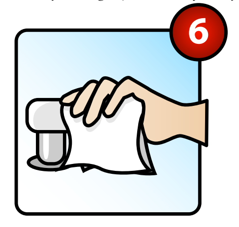
Use a paper towel to turn off the water faucet.

Rub your hands together vigorously. Work into a lather from wrist to fingertip. Scrub under your fingernails, between your fingers, and under jewelry.